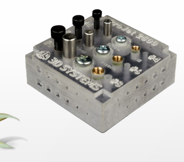
VisiJet M2 ENT Elastomeric natural